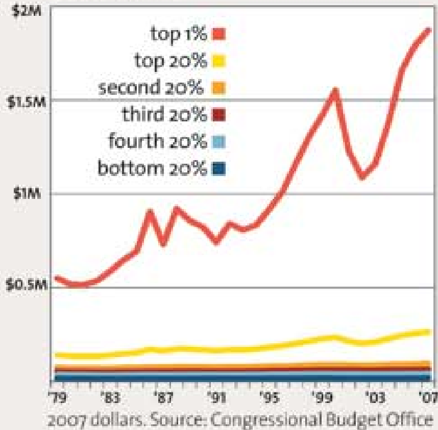
AVERAGE HOUSEHOLD INCOME before taxes